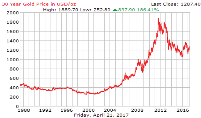
Figure 1: Trends in the price of gold last 30 years